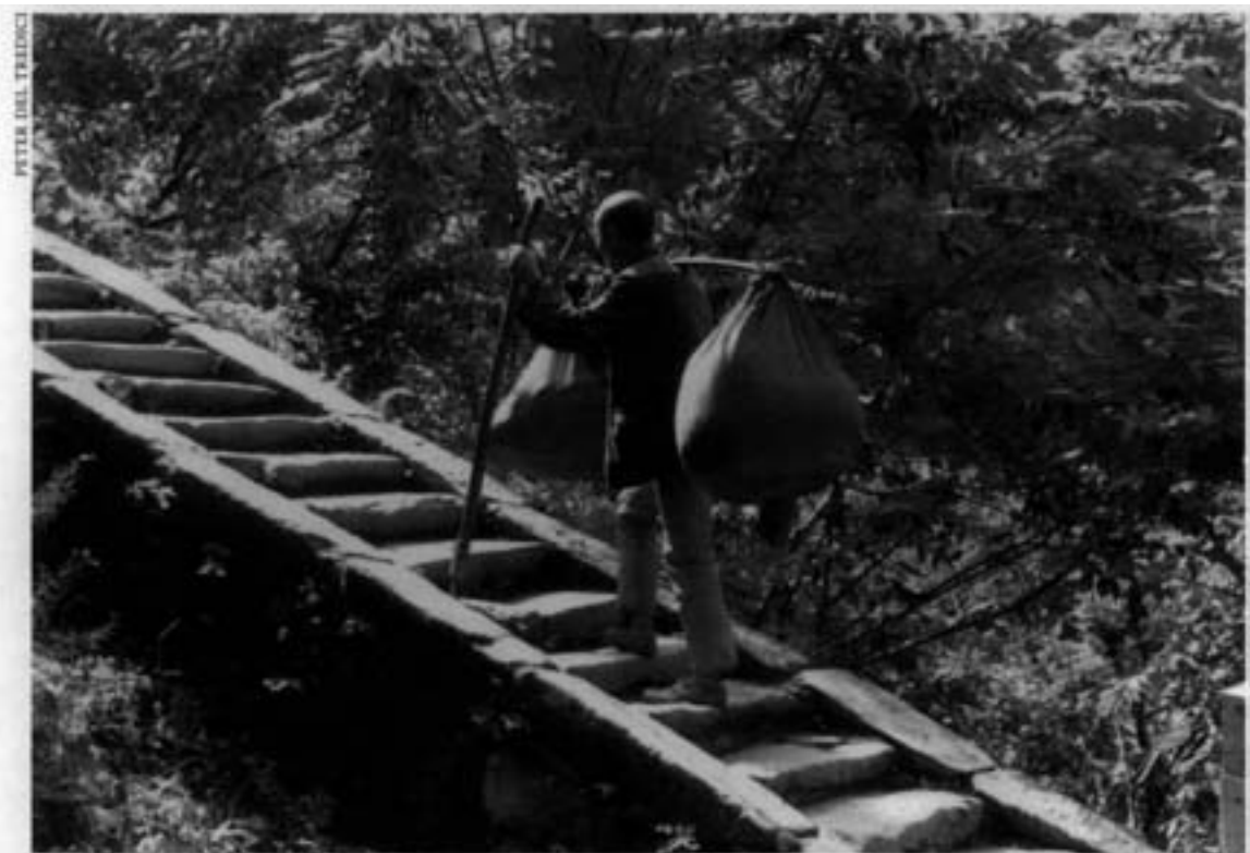
All supplies must be carried on foot up an ancient stone path to the summit of Wudang Shan.