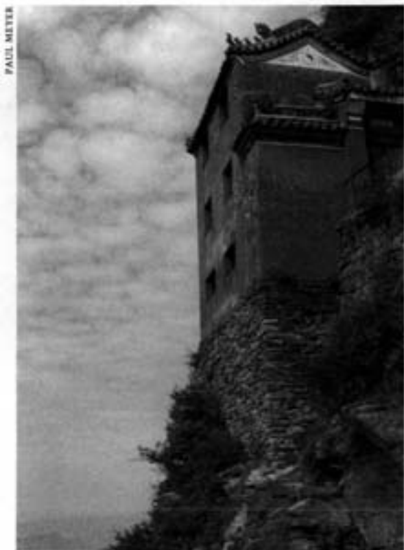
One of the many buildings clinging to the cliffs near the top of the Pillar-of-Heaven Peak.

as to commercial nurseries. Over time, young plants will be put in the ground and evaluated for performance under a variety of field conditions. In the grand scheme of things, seed collection is only the first step of a lengthy process that includes propagation, cultivation, evaluation, and selection.