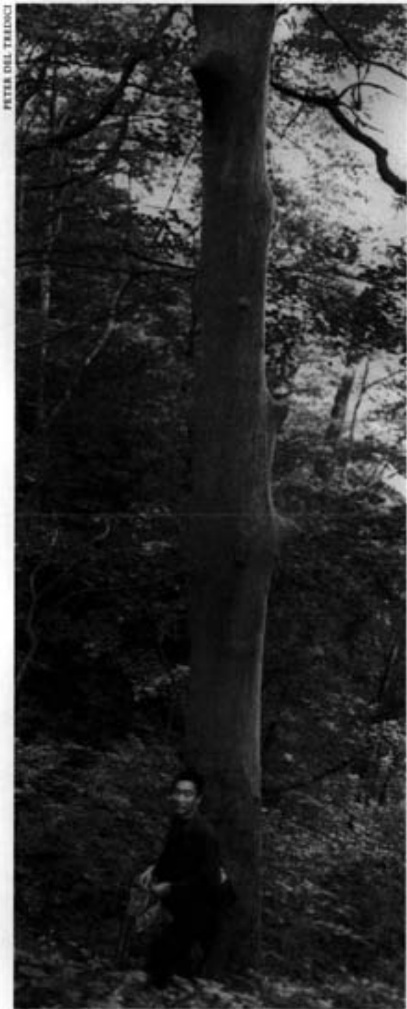
A spectacular specimen of Stewartia sinensis , 15 meters tall and 55 centimeters at breast height, growing at an elevation of 1,100 meters on Wudang Shan.

both in the family Hamamelidaceae. The former reached tree-size proportions on Wudang Shan, upwards of 10 meters, while the latter was decidedly shrubby. At lower elevations we encountered the marginally hardy but very beautiful Loropetalum chinense , growing up to 4 meters tall. This plant produces large masses of beautiful white flowers in late winter, but unfortunately can be grown out-of-doors only in the southern portions of the United States.