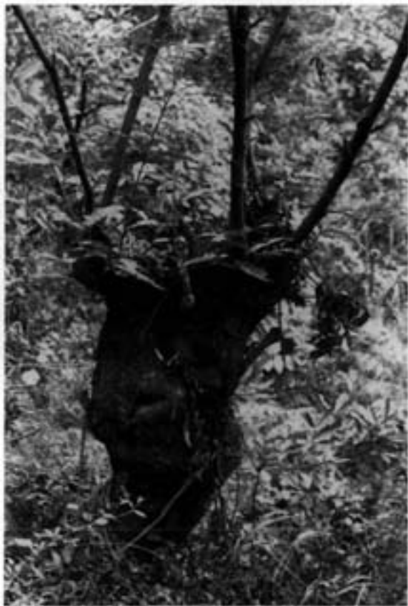
PETER DEL TROSCCI

The weather was alternately foggy and rainy, creating a mysterious mood in the forest. Shortly after leaving the main trail leading to the summit, we entered a forest dominated by large specimens of pine and oak, Pinus tabulaeformis , the tabletop pine, and Quercus aliena , an oak similar to our native chestnut oak. Continuing along the path, we came upon a rustic stone house built into the side of a ver-