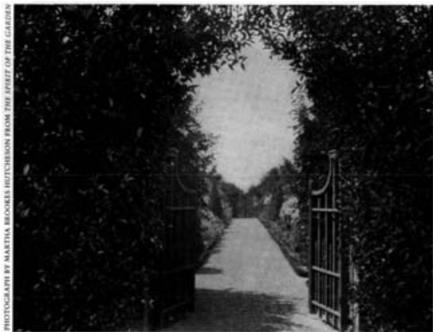
Gates along an axis in Maudesleigh's flower garden.

in any degree intact today and open to the public. Although the house is no longer extant, the drives and gardens she designed for it are now part of Maudslay State Park.