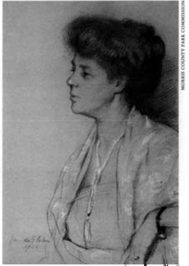
Charcoal sketch of Martha Brookes Hutcheson by Jane de Glehn, 1922.

MIT's program strongly emphasized the architectural and scientific aspects of landscape design, with courses such as perspective and