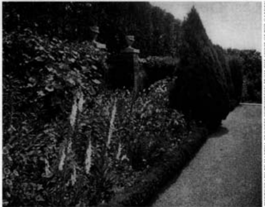
A gateway and border in the flower garden at Maudesleigh.

Because of its size and visibility within the community of wealthy New England garden builders, Maudesleigh was a tremendously important commission for Hutcheson. It is also significant as one of the few remaining Hutcheson designs