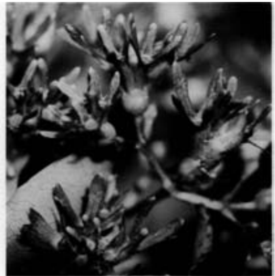
A close-up view of a fruit cluster. The calyxes are especially obvious in this photograph.