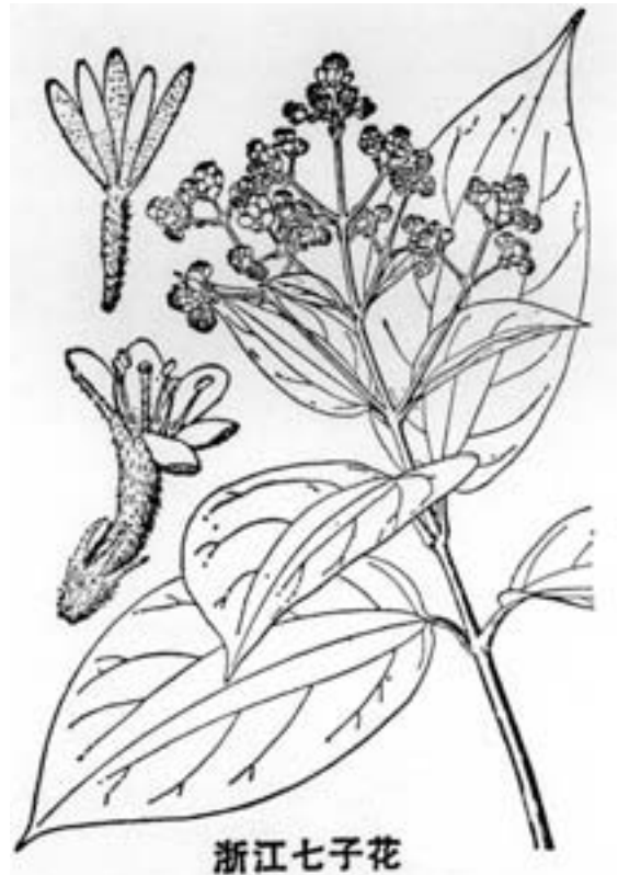
Illustration of an inflorescence, a single flower, and a fruit of Heptacodium jasminoides as rendered in Volume 4 of Iconographia Cormophytorum Sinicorum (see the "Bibliography and Iconography").

On nursery plants exposed to full sun, the leaves fell away without any change in color, however, except perhaps for the slightest tinge of yellow. However, rooted cuttings that grew nearby in quart-sized plastic containers and provided with light shade did turn a splendid shade of muted purple. What caused this color? Was it moisture stress,