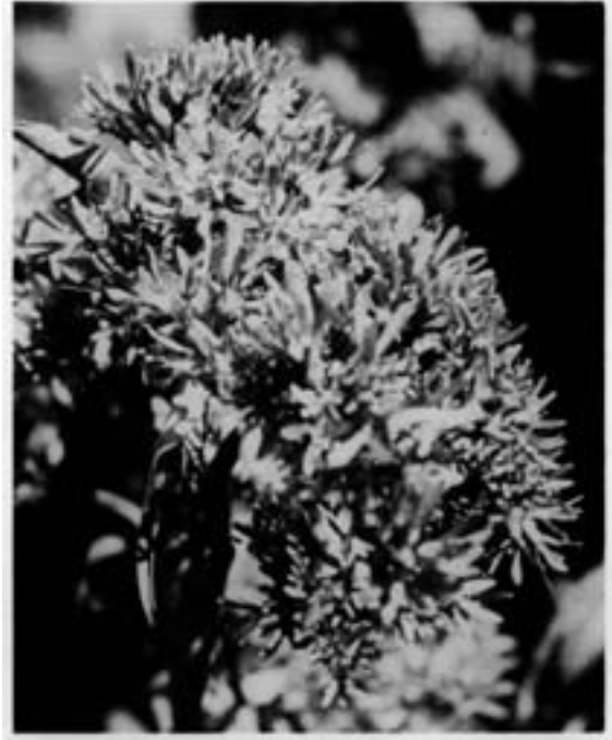
A large cluster of Heptacodium fruits, each with its "accrescent persistent calyx" These clusters of rich purple fruits are the chief ornamental feature of Heptacodium jasminoides. The color lasts for several weeks as the fruits continue to ripen

The Arnold Arboretum has already produced several hundred plants from softwood cuttings. The cuttings were taken from both seedling lots during the summer of 1985. On July 8, one hundred twenty cuttings were taken from all eleven parent plants. The cuttings, which were four to six inches (ten to fifteen centimeters) long, were given a five-second dip in a solution of ten thousand parts