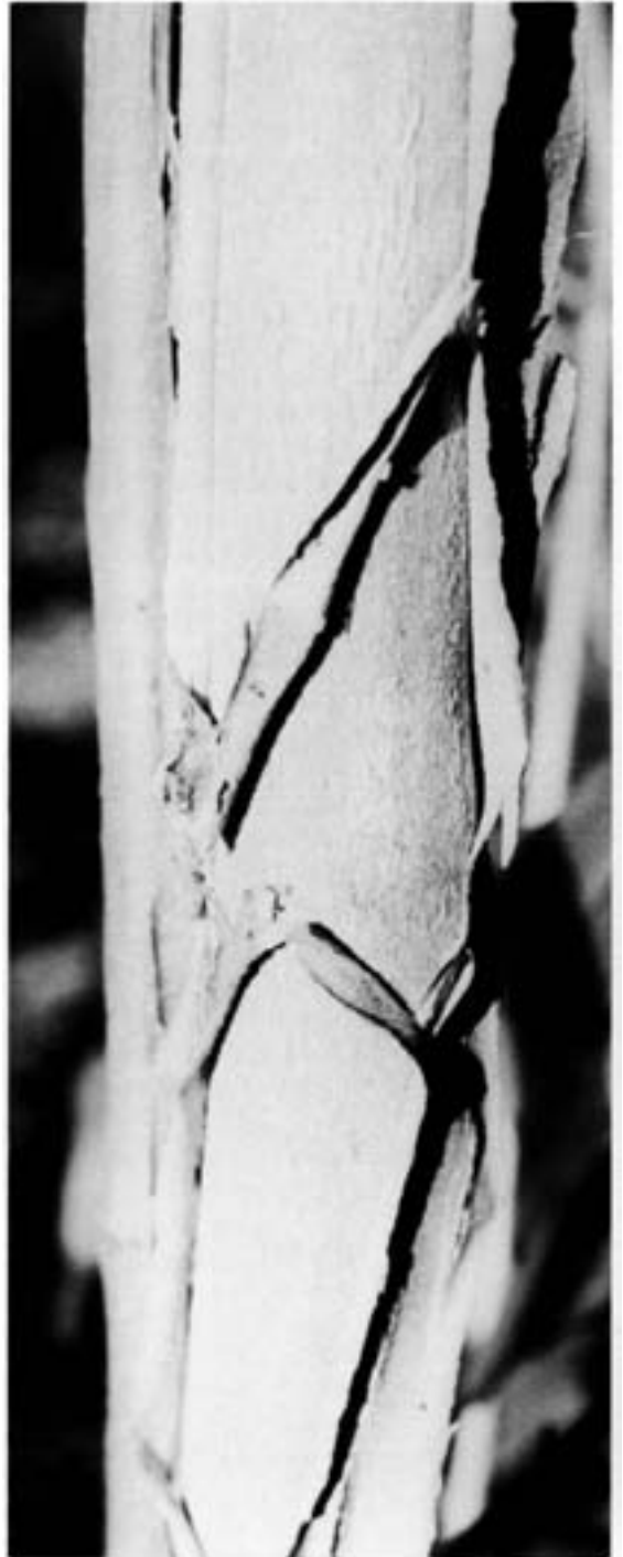
The thin bark of Heptacodium, peeling off in paperlike strips or sheets.