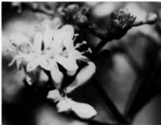
A close-up view of the inflorescence

While growth has been rapid, no mature plants of Heptacodium jasminoides yet exist in North America. Therefore, it remains to be seen what the ultimate height, spread, and form might be. According to the Chinese literature, the plant grows as a small tree, reaching seven meters (twenty-three feet) in height. They state that it grows best in the shade of trees. During April 1985, I had the