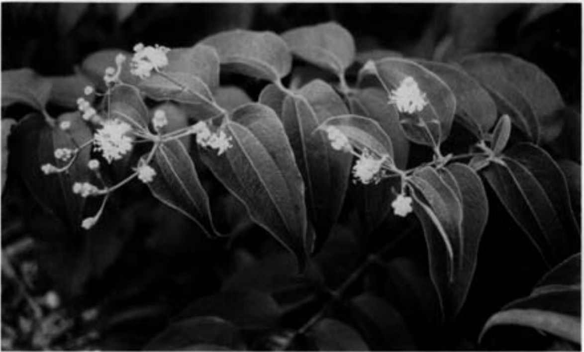
A spray of Heptacodium jasminoides. The “opposite trinerved leaves” and “superficially jasmine-like flowers” are easily seen in this photograph.