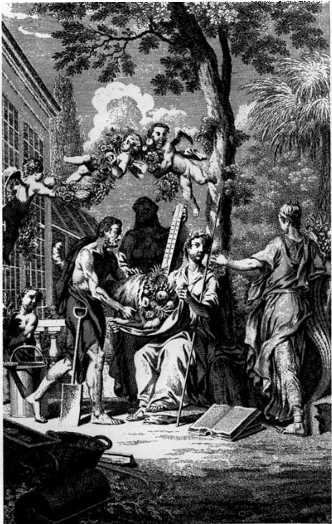
Frontispiece from the sixth edition of The Gardener's Dictionary by Philip Miller, 1752.